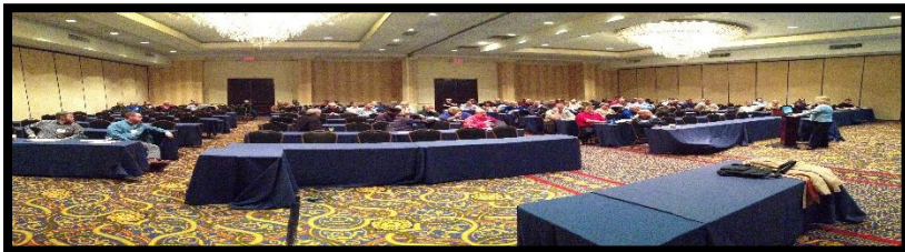
PHMSA Addressing KGA Membership at 2013 EXPO

Please visit the Expo Registration Website and www.KyGas.org .